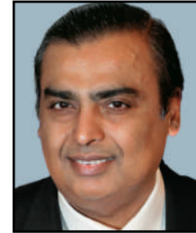
April 19 Hon. Rtn. Mukesh Ambani